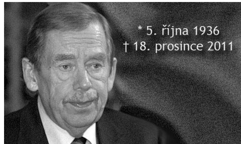
Václav Havel (1936-2011)

The Executive Board of the Czechoslovak Society of Arts and Sciences extends its condolences and sympathy to the family of Václav Havel and citizens of the Czech Republic in their sorrow over the death of the last President of Czechoslovakia and the first President of the Czech Republic, Mr. Václav Havel. President Václav Havel, a world-renowned playwright and humanist, will be remembered for his essential contributions to the fall of Communism in Czechoslovakia, its transformation into multi-party democracy and for bringing it into the western world, as well as for his defense of human and civic rights around the world.