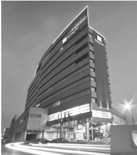
Hotel Holiday Inn Žilina **** http://www.holidayinn-zilina.sk/en/