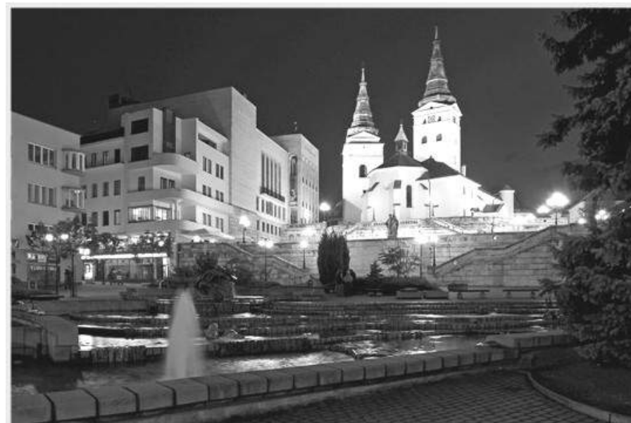
Žilina - nám. A. Hlinku square and the Parish church

There will also be a pre-Congress opportunity to participate in a two-day Wine Tasting Tour of the Wineries at Modra ($99 Euro plus hotel expenses). For further information please see: www.svu2000.org