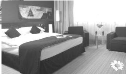
HOTEL ECONO *** http://www.econohotel.sk/?lang=en