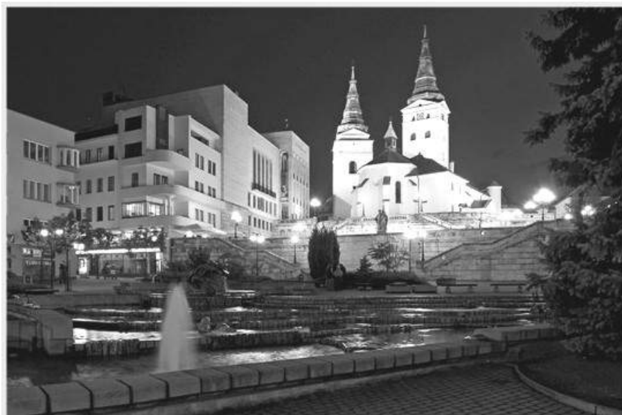
Žilina - nám. A. Hlinku square and the Parish church