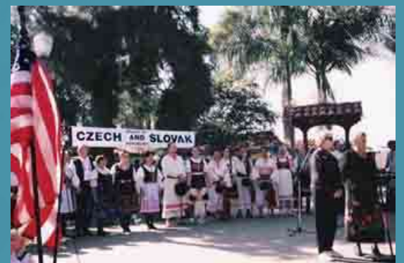
Annual Lawn Programs of the House of Czech and Slovak Republics are very popular and well attended.