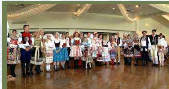
Annual display of traditional hand-made „kroj“

On Sunday, October 25th, 2015 from 11:00am until 3:30pm at Knollwood Country Club, you will have a chance to experience traditional folklore festivity full of dancing, singing and good Czech cuisine.