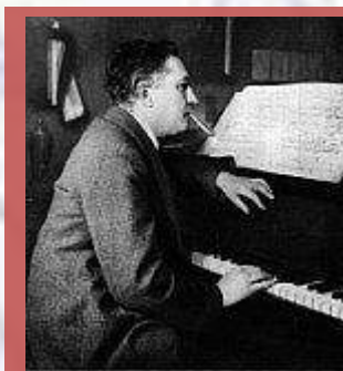
Josef Suk (left and above)