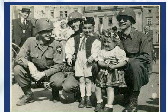
It meant more than freedom, it meant friendship between Americans and Czechs