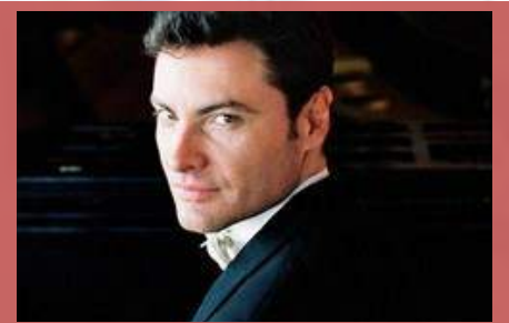
Pianist Fabio Banegas