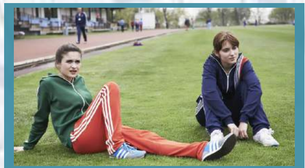
Andrea's Sedláčková's feature “Fair Play”